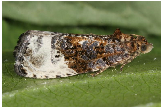
Hedya nubiferana (green budworm) adult.