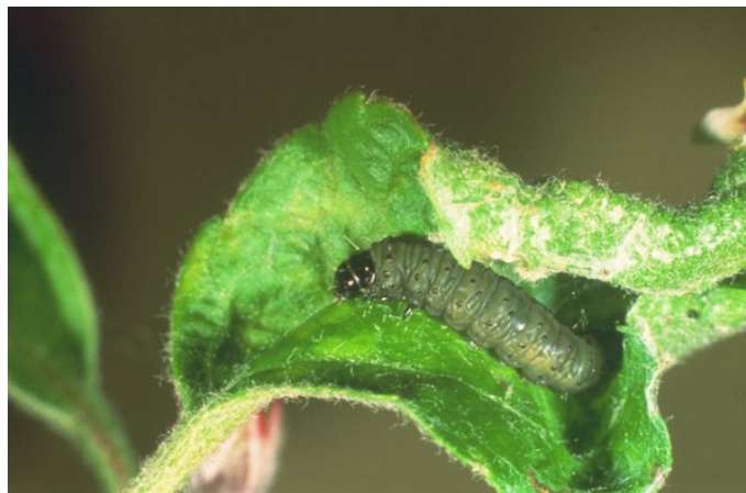
Hedya nubiferana larva.