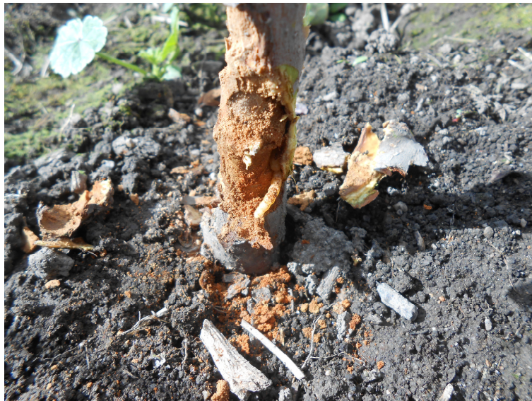
Chrysobothris mali larva at the base of an apple sapling in Kelowna.

http://www.srs.fs.usda.gov/pubs/misc/ah_706/ah-706.htm [last accessed 29 April 2016]