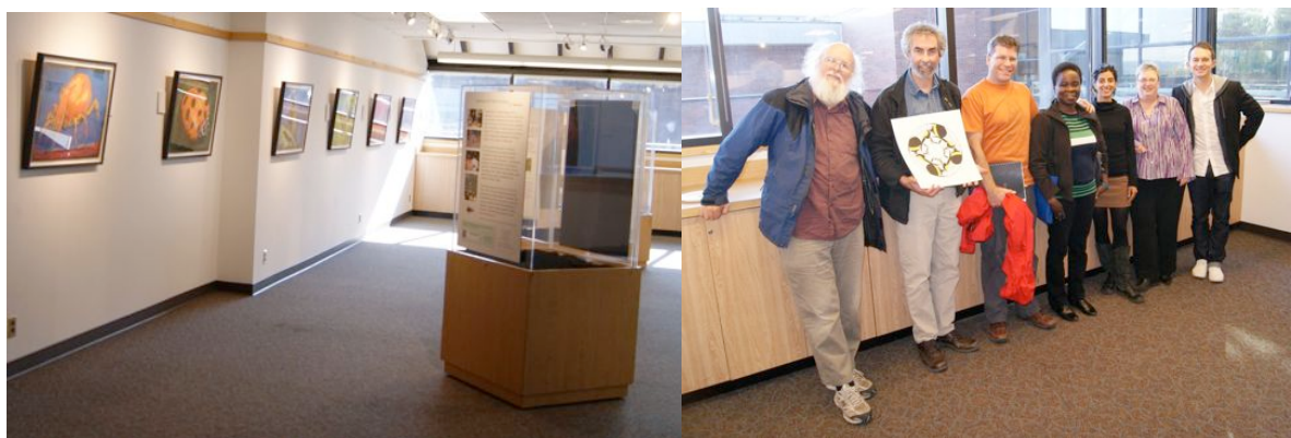
Random shots from the ESBC AGM