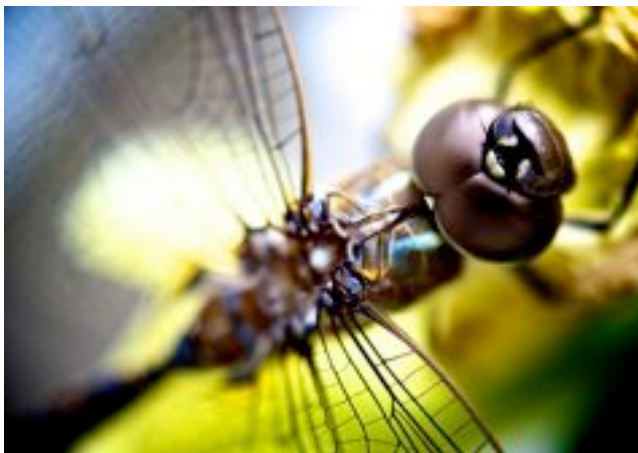
Random dragonflies.