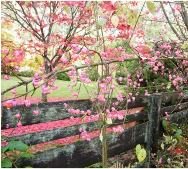
Spindle tree and Japanese Maple colours in a Burnaby garden, 2011. Insects not obvious but probably present.