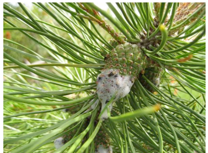
Nymphs of the pine spittlebug, Aphrophora sp., feeding on a lodgepole pine cone at the Bailey road Seed Orchards near Vernon BC.