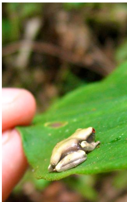
Delightful inhabitant of the lowland rainforest of Ecuador, 2011.