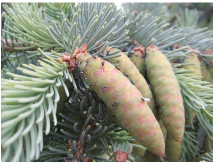
Torymus azureus female parasitoids probing for larvae of the spruce cone axis midge, Kaltenbachiola rachiphaga, in a spruce cone at the Kalamalka Seed Orchards in Vernon BC.