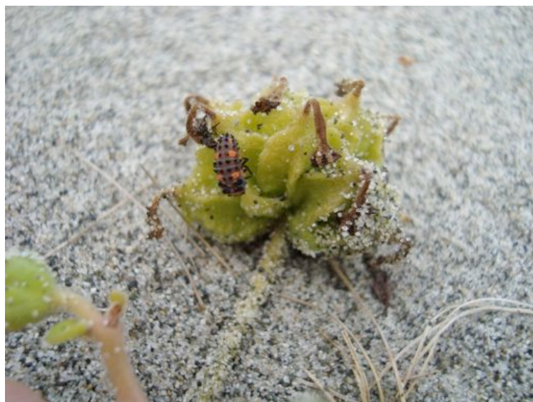
Coccinellid larvae, Victoria area.