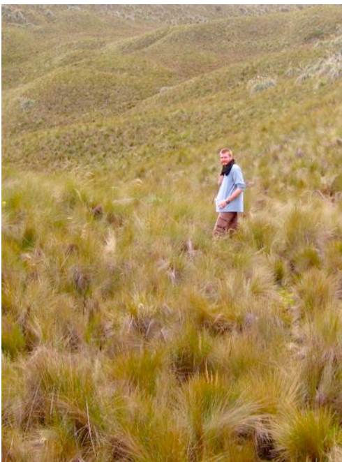
Rudi Verspoor desperately seeking web-building spiders (and a trail...) in the high Andes of Ecuador, Summer 2011.