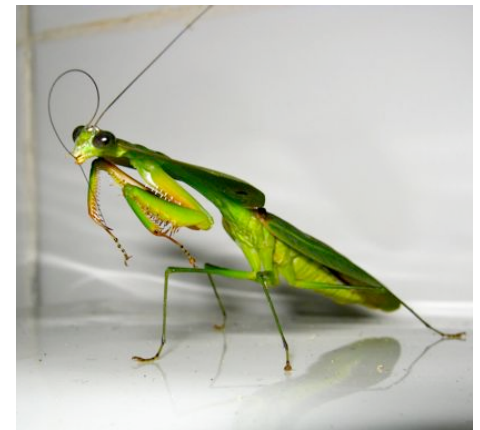
Bathrooms in the rainforest of Ecuador are prime field sites for conducting insect diversity surveys, 2011.