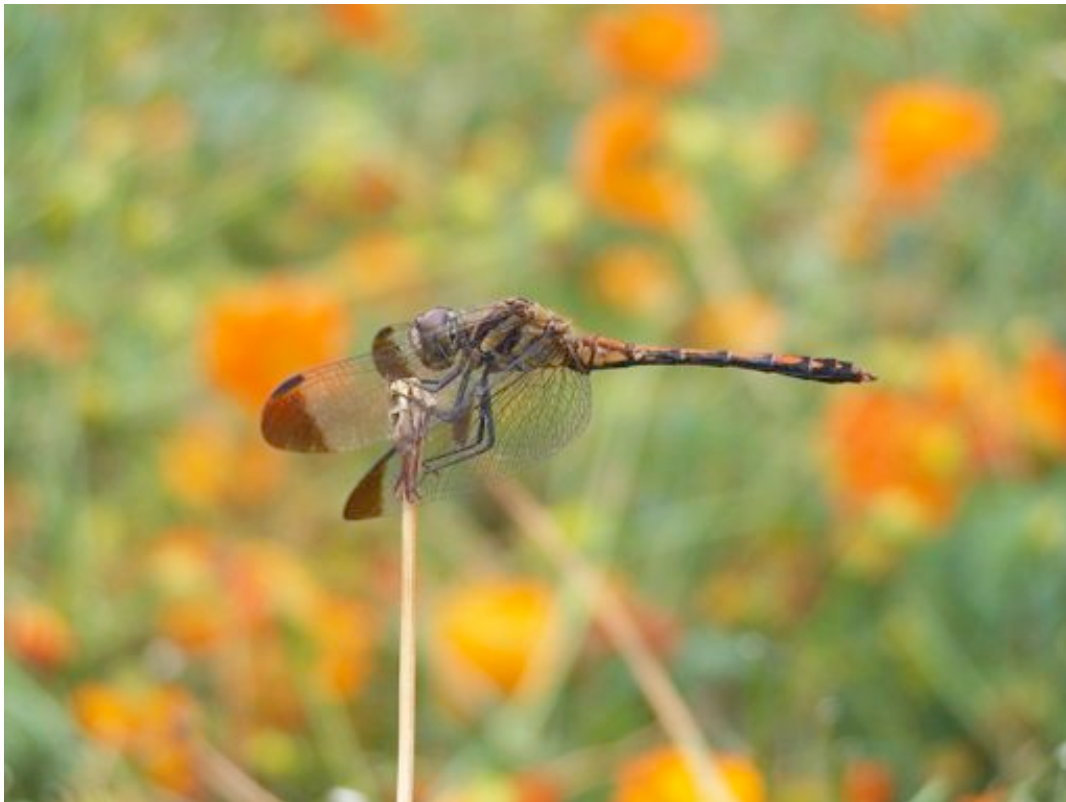
Dragonfly in downtown Tokyo, photograph by Simon Zappia.

Cover Photographs: Photograph by Bernie Roitberg.