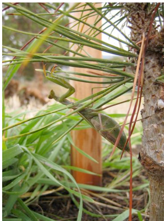
Female praying mantis, Mantis religiosa, on a lodgepole pine tree at the Kalamalka Seed Orchards in Vernon BC. Summer 2011.