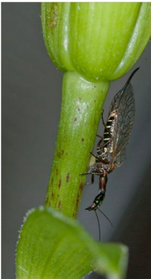
Snakefly

The Entomological Society of British Columbia is a scientific Society founded in 1902 for the advancement of entomological knowledge in the province.