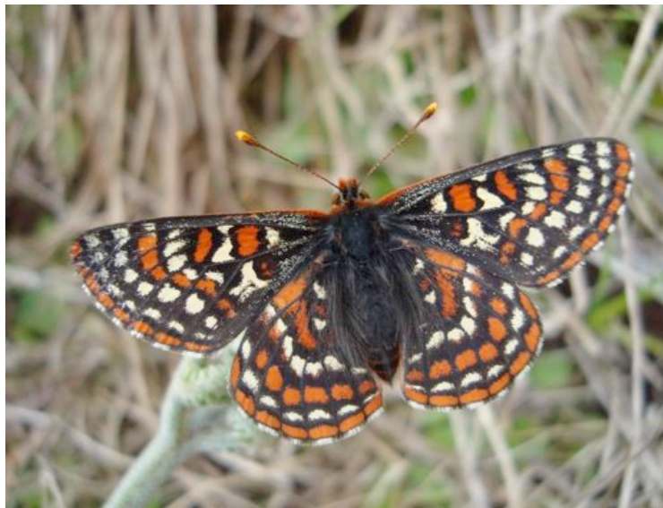
Taylor's Checkerspot ( Euphydryas editha taylori) on Denman Island, 2009