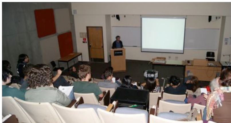
Random shot from the ESBC AGM

1515-1530 Announcement of student presentation winners