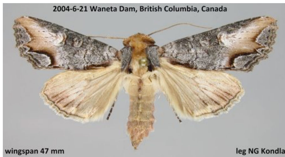
Admetovis oxymorus