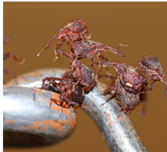
Cirque du Weevil - acrobatic weevils pose for effect.