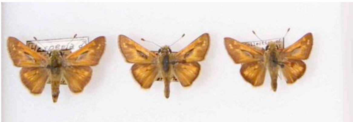
Western Branded Skipper ( Hesperia oregonia colorado ) specimens from the Royal B.C. Museum. This species is up for assessment by the Committee on the Status of Endangered Wildlife in Canada.