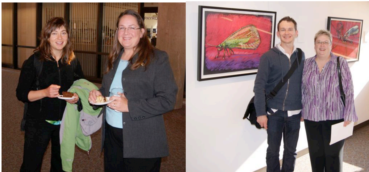
Random shots from the ESBC AGM

1030-1100 COFFEE BREAK (Coffee and refreshments provided)