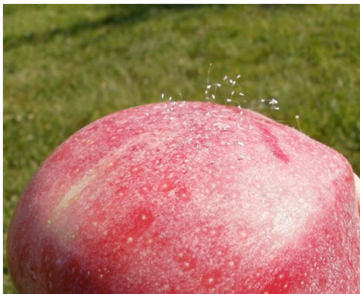
Lacewing eggs on gala apple Hartmann Orchard Osoyoos BC September 2011.