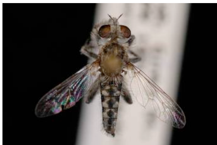
Ophion wasp and robberfly analyzed for DNA barcoding projects at the Beaty Biodiversity museum.