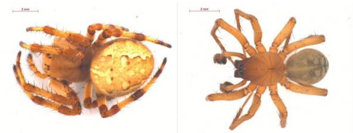
Spiders analyzed as part of a project constructing a DNA barcoding library for BC's Aranae.