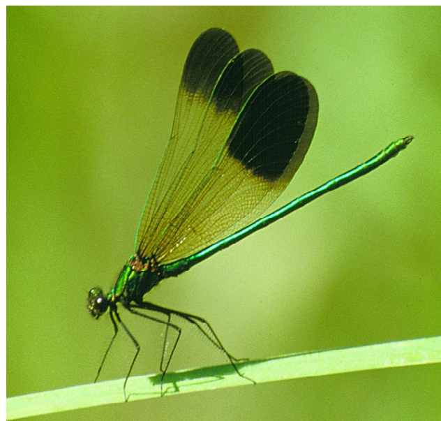
Male Calopteryx aequabilis (River Jewelwing).

The River Jewelwing at Christina Creek is vulnerable to the negative effects of introduced fish and aquatic plants as well as stream bank erosion caused by boats and jetskis. Since its discovery, the small damselfly population has been designated S1 (red list) by the BC Conservation Data Centre (BCCDC 2011).